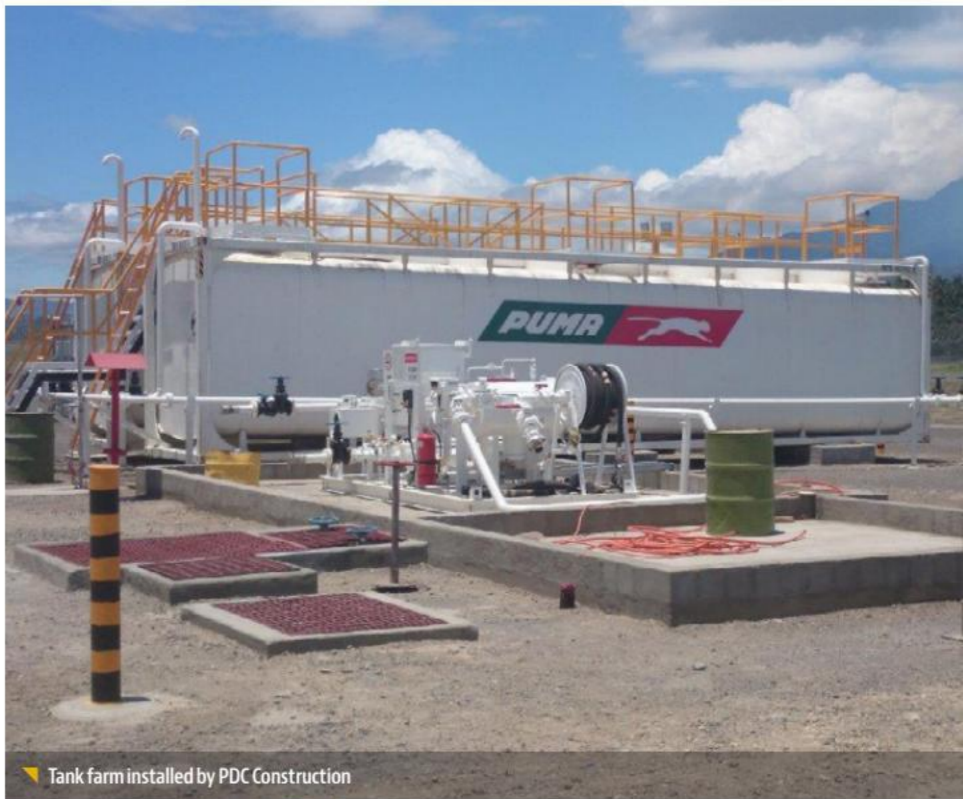
▼ Tank farm installed by PDC Construction