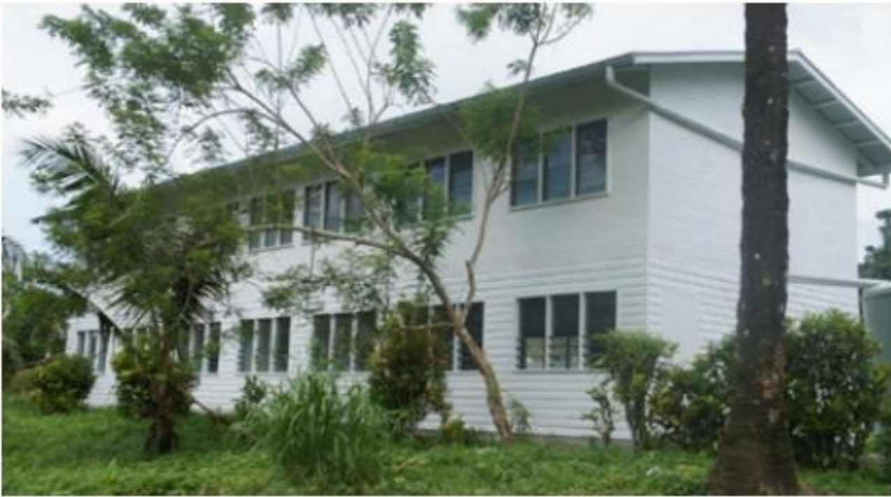
▼ 4-in-1 classroom kit constructed by PDC