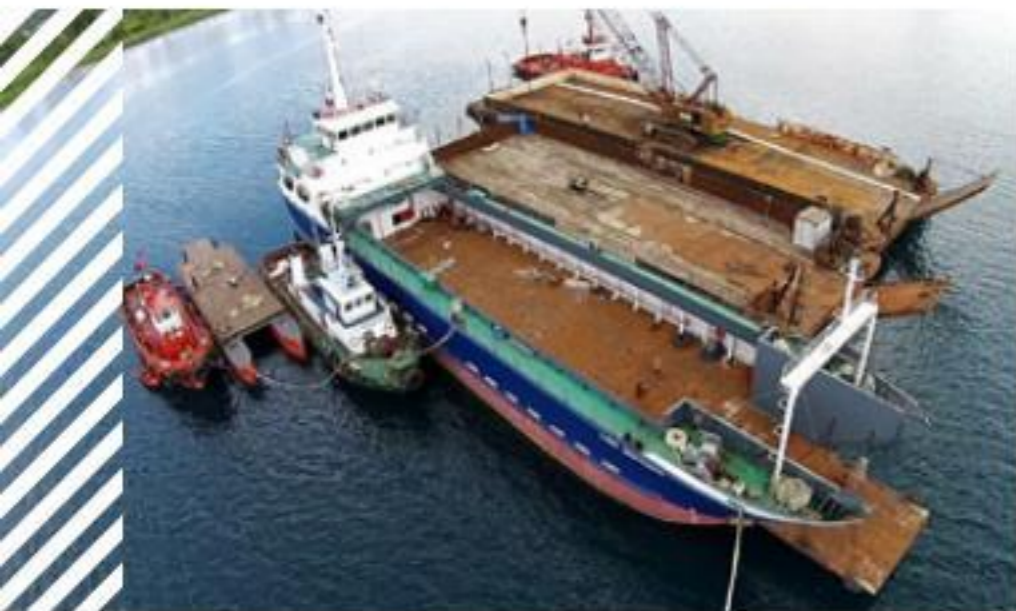
▼ PDC's shipping division provides access to even the most remote areas

Consequently being earmarked for new sector projects – which, in