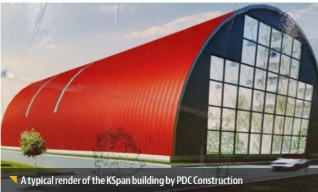
▼ A typical render of the KSpan building by PDC Construction