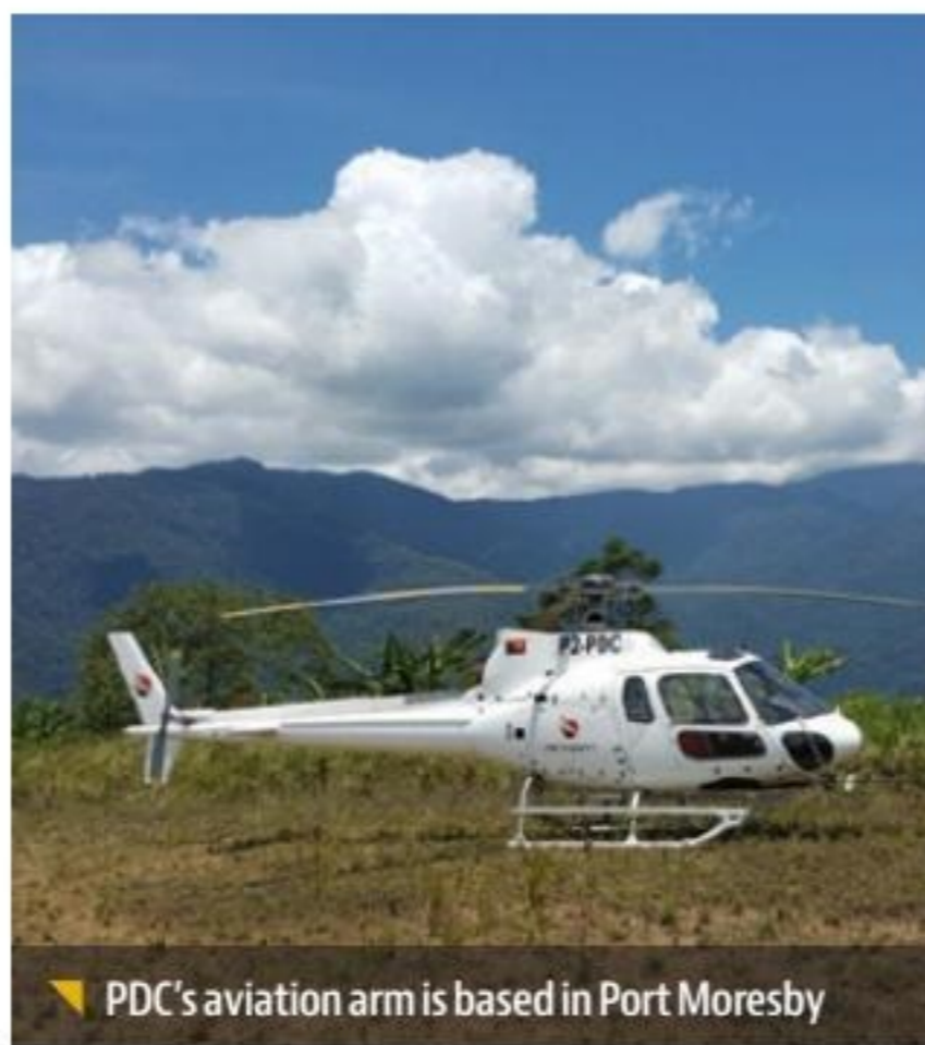
▼ PDC’s aviation arm is based in Port Moresby

a supply chain perspective – with China, Malaysia, Singapore, India and Vietnam initial targets of expansion – but given PDC’s unparalleled experience and knowledge of the unique PNG domain, it is this most familiar and challenging of countries that remains the principal focus moving forward.